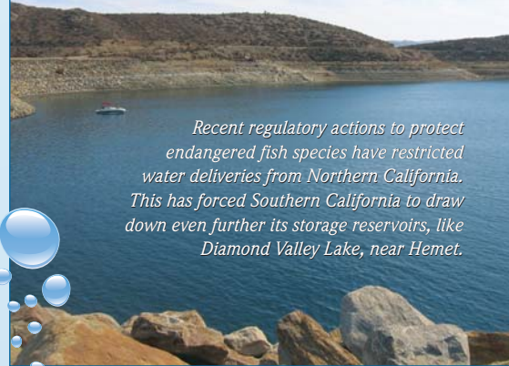
Recent regulatory actions to protect endangered fish species have restricted water deliveries from Northern California. This has forced Southern California to draw down even further its storage reservoirs, like Diamond Valley Lake, near Hemet.

EOCWD imports water from Metropolitan Water District of Southern California and produces water using chloramines, a combination of chlorine and ammonia, as its drinking water disinfectant. Chloramines are effective killers of bacteria and other microorganisms that may cause disease. Chloramines form less disinfection byproducts and have no odor when used properly. People who use kidney dialysis machines may want to take special precautions and consult their physician for the appropriate type of water treatment. Customers who maintain fish ponds, tanks or aquaria should also make necessary adjustments in water quality treatment, as these disinfectants are toxic to fish. For further information or if you have any questions about chloramines please visit www.eocwd.com or call (714) 538-5815.