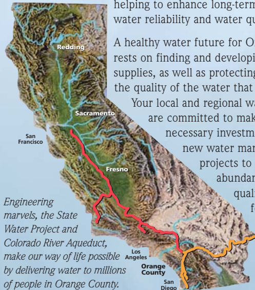
Engineering marvels, the State Water Project and Colorado River Aqueduct, make our way of life possible by delivering water to millions of people in Orange County.

Your local and regional water agencies are committed to making the necessary investments today in new water management projects to ensure an abundant and high-quality water supply for our future.