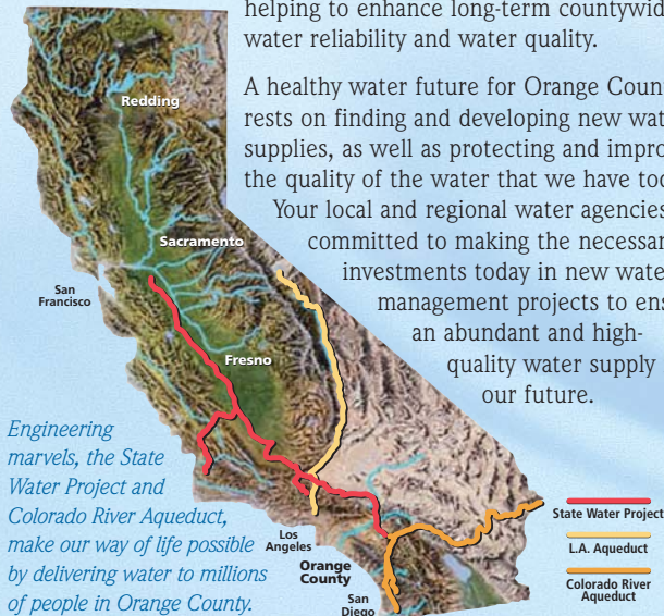
Engineering marvels, the State Water Project and Colorado River Aqueduct, make our way of life possible by delivering water to millions of people in Orange County.

A healthy water future for Orange County rests on finding and developing new water supplies, as well as protecting and improving the quality of the water that we have today. Your local and regional water agencies are committed to making the necessary investments today in new water management projects to ensure an abundant and high-quality water supply for our future.